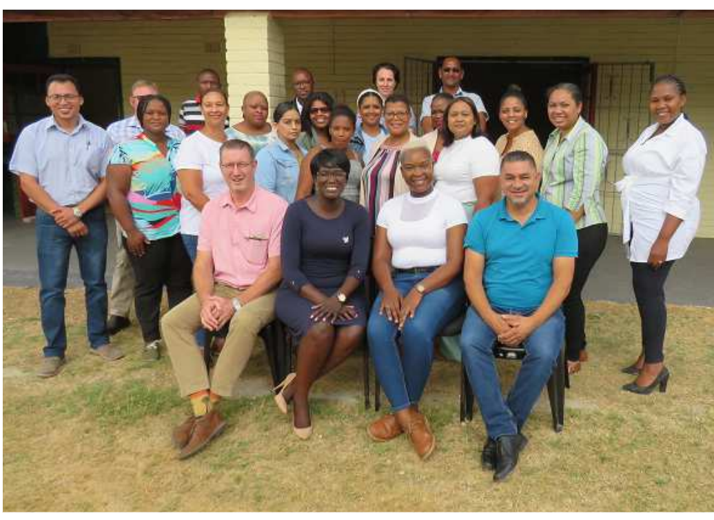
Pictured above: The Municipal Health Services Department during their strategic planning session in March.

Municipal Health Services are rendered to ensure protection of public health in the