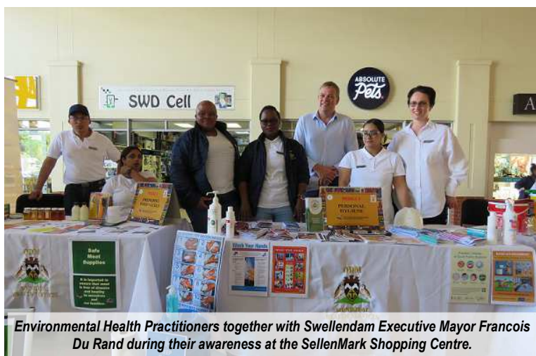
Environmental Health Practitioners together with Swellendam Executive Mayor Francois Du Rand during their awareness at the SellenMark Shopping Centre.

The MHS department also rolled out community awareness at the SwellenMark Shopping Centre, as well as in the informal settlement where they distributed brochures regarding waste management and illegal dumping.