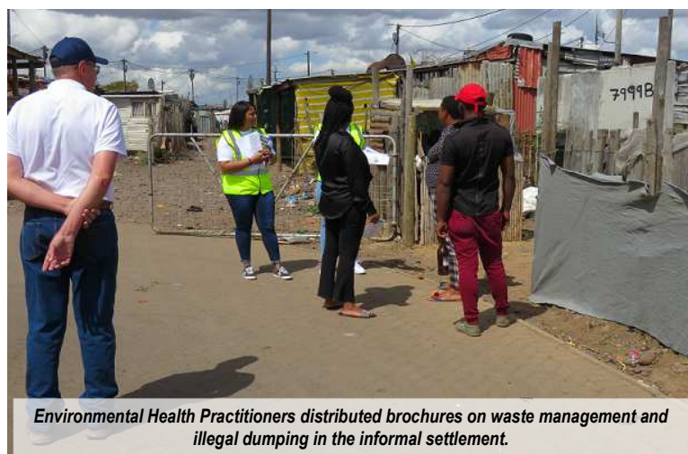
Environmental Health Practitioners distributed brochures on waste management and illegal dumping in the informal settlement.