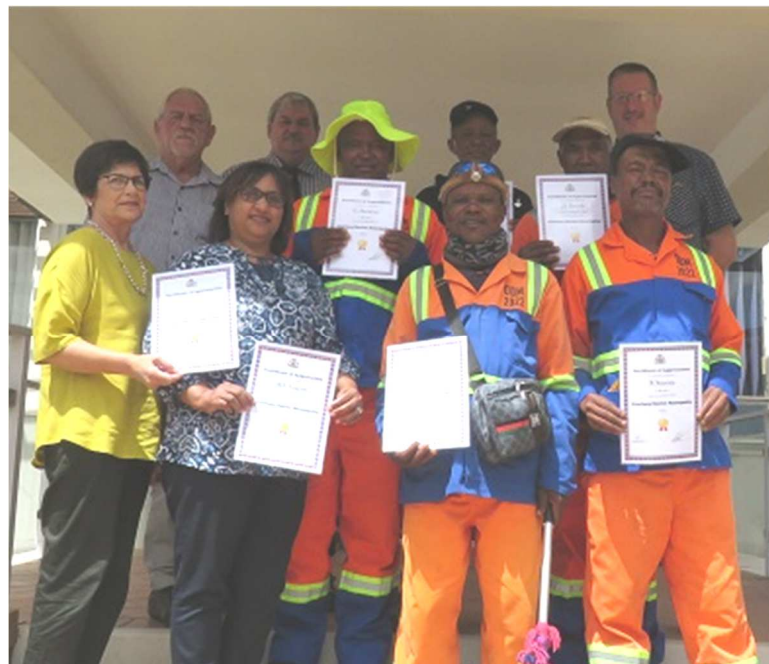
Pictured Above: The recipients of the long service recognition certificates from the Overberg District Municipality.