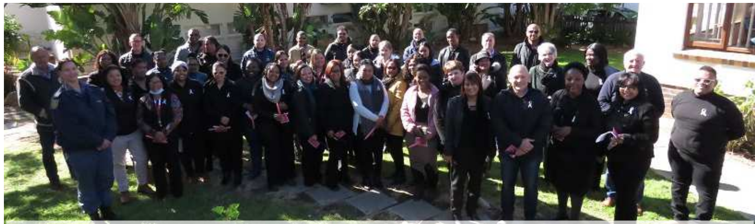
The Overberg District Municipal Staff and Leadership who participated in a Women's Month Celebration held at the ODM Head Office.

Staff from the ODM Head Office, together with Municipal Leadership, participated in a Women's Month Celebration held on Monday, 1 August 2022, to commemorate the significant role held by women in South African society and to celebrate the accomplishments of the staged march by women to the Union Buildings in 1956.