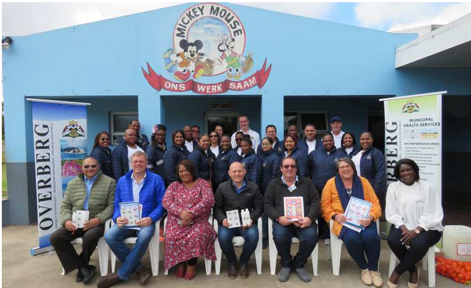
The Municipal Health Services department together with ODM and Swellendam political leadership during their visit to one of the pre-schools in Swellendam.

The Municipal Health Services Department of the Overberg District Municipality celebrated World Environmental Health Day under the theme, "Strengthening Environmental Health Systems for the implementation of the Sustainable Development Goals".