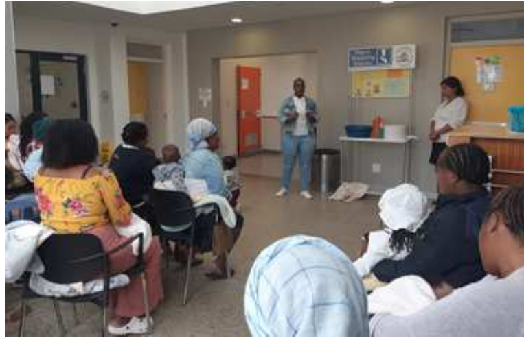
Basic handwash education was also conducted at Hermanus Community Day Center.

Global Handwashing Day, celebrated each year on October 15, is a global advocacy day dedicated to increasing awareness and understanding about the importance of handwashing with soap as an effective and affordable way to prevent diseases and save lives.