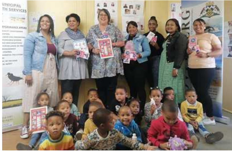
The representatives who rolled out awareness in the Swellendam municipal area.