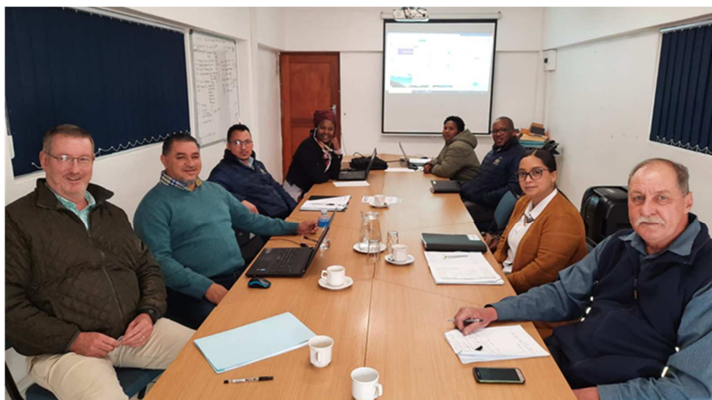
Members of the Technical Committee, one of the committees established to enhance Municipal Health Services.

The Food Safety Committee aims to improve and advance food safety throughout the Overberg District through the understanding