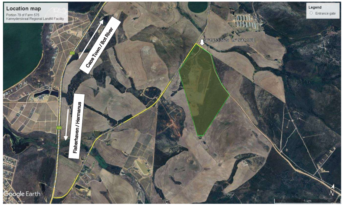
Figure 1: Location map

The property, Portion 79 of Farm 575, is approximately 83 ha in extent and serves as an operational landfill site