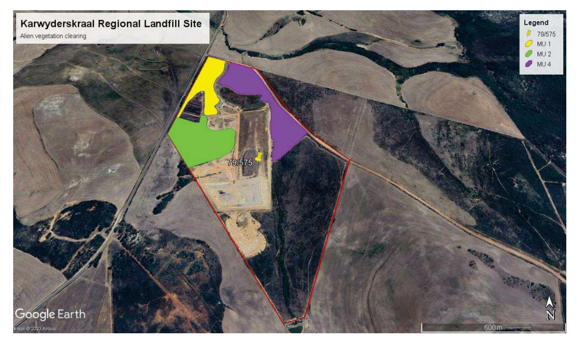
Figure 2: Initial clearing was done in highlighted (yellow, green, purple) areas